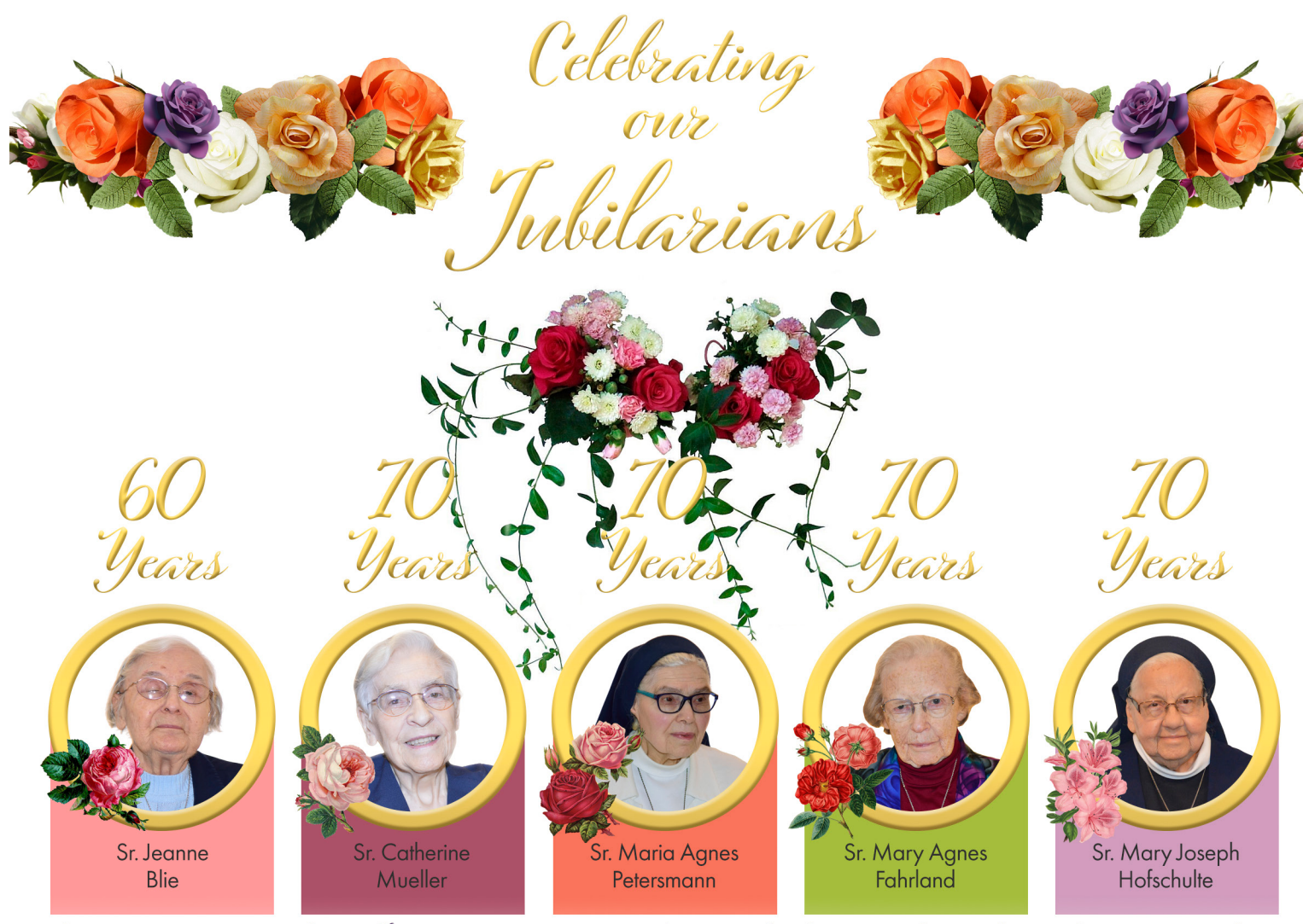
God is not unjust; he will not forget your work and the love you have shown him as you have helped his people and continue to help them. Hebreus 6:10